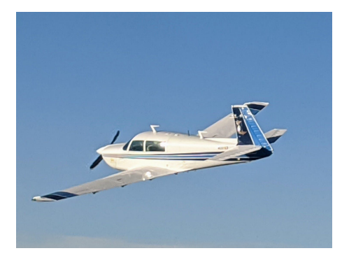
Acute (and low)